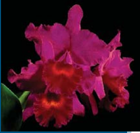
C. Penang 'Black Caesar'

Last month I saw a picture of a beautiful Cynodes in a magazine and when I searched for a grower Pine Ridge Orchids popped up. I had not heard of them before but decided to see if they had the Cynode I was interested in available for purchase. The owner, Terry Glancy, was very helpful and knowledgeable. I ended up purchasing several plants and when they arrived I was very surprised and pleased at the high quality of the plants. They arrived very well packed and in perfect condition. I recommend that you go to his website at www.pineridgeorchids.com and give them a try. If you do purchase anything from Terry please let me know how the transaction went. I like to keep our files up-to-date on members good and bad experiences with different vendors. If you have a vendor that you'd like to comment on please let me know. Your fellow members will appreciate it!